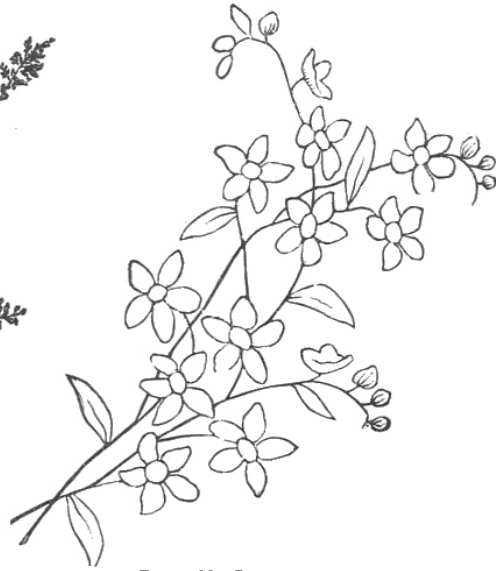
FIGURE NO. 7.