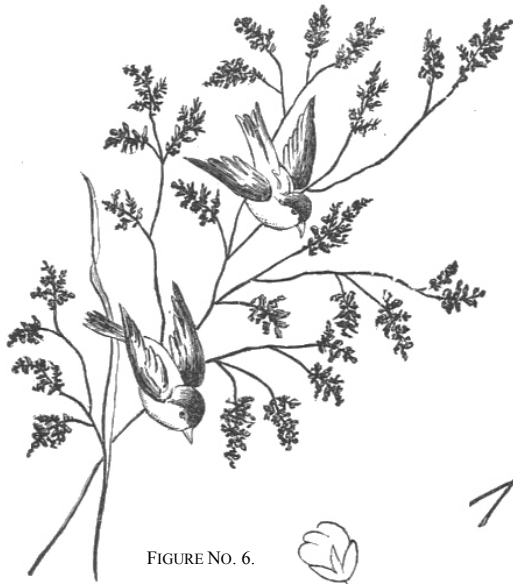
FIGURE NO. 6.

FIGURES Nos. 6, 7, 8 AND 9. — These designs are the proper size for the sachet pictured above, and may be done in satin stitch, solid Kensington or outline stitch, or they may be painted, as preferred. The designs are also handsome for decorating other articles, such as mouchoir (handkerchief) and glove cases, scarves, tidies, etc.