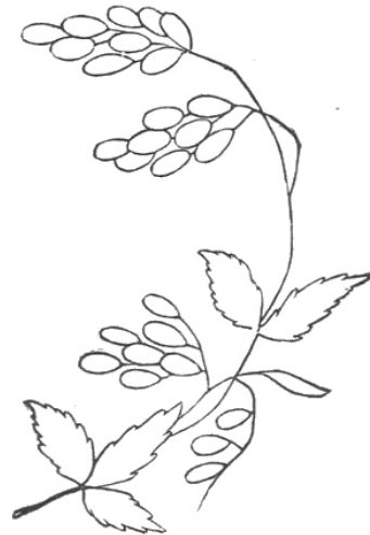
FIGURE NO. 9.