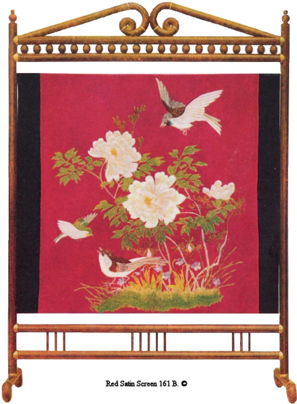
Red Satin Screen 161 B.